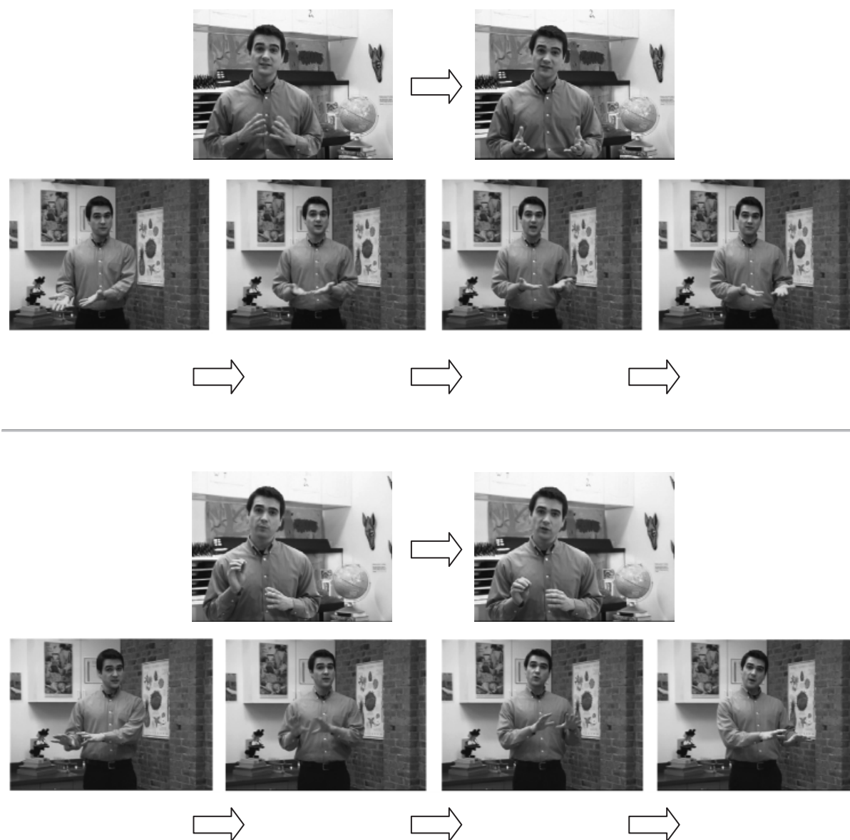
Fig. 1. Screen shots from the two videos: eager delivery style (top panel) and vigilant delivery style (bottom panel). For each video, two illustrative sequences are shown.